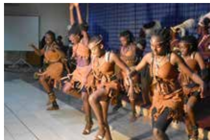
The winning team entertains guests of Tweekembe and MULIA at their concert