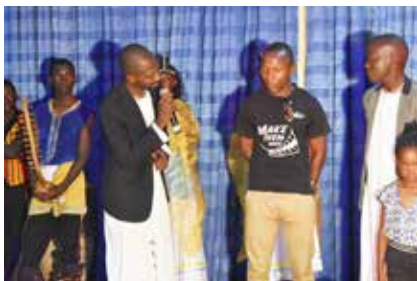
The ED of Tweekembe and Our Team Leader listening to the ED Mulia Foundation during their concert