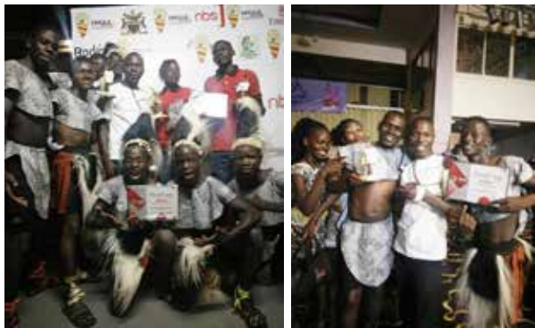
Rockies Troupe after being awarded the best cultural troupe in Uganda by Ekkula Pearl of Africa Tourism Awards

both within the country and outside. Voted the best Cultural Troupe in Uganda by Ekkula Pearl of Africa Tourism Awards in conjunction with the Ministry of Tourism gave us mileage across the globe.