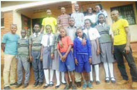
Some of the students from school with visitors from Tweekembe Development Organisation

Rockies Talent, Leadership and Skills Development Academy, a hub for all skills development initiatives that Rockies runs for the young people. The major highlight of this year, is that we have been able to acquire 2 acres of land in Nakawuka-Wakiso district where the academy will be established thanks to Segal Family Foundation, our board chairperson alongside her team, all our development partners and the good Samaritans. We have also been able to increase our intake by 8 talents making our current total of 50 young people 24 of these are girls and 26 boys.