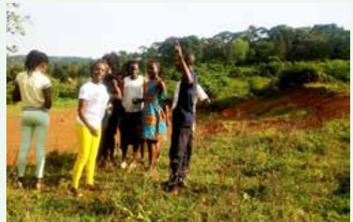
Team leader showing some of the members land marks

As our education sponsorship program continuously gains momentum, we are pleased to report that this year alone we have managed to take 42 young boys and girls to school. This is fundamental to our programming as we ensure that all members recruited by Rockies receive a descent formal education.