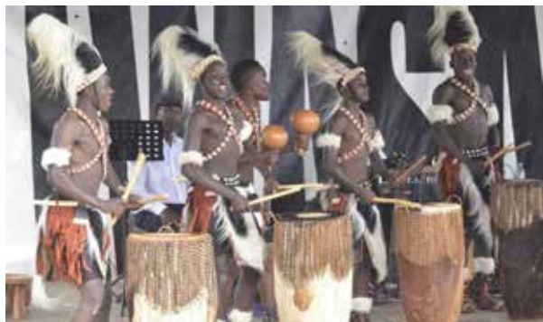
Rockies Troupe performing at the Chinese Boat Festival

Uganda National Council for Science and Technology one of our development partner, during their stake holder meeting at Kampala Serena Hotel, gave us an opportunity as Rockies Troupe to entertain their guests during the course of the meeting and later at the dinner.