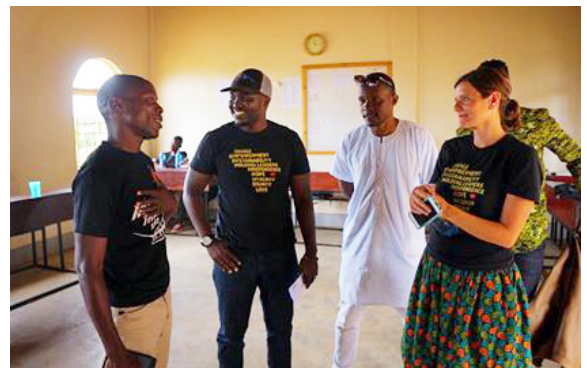
Rockies leadership sharing a light moment with Musana Leadership