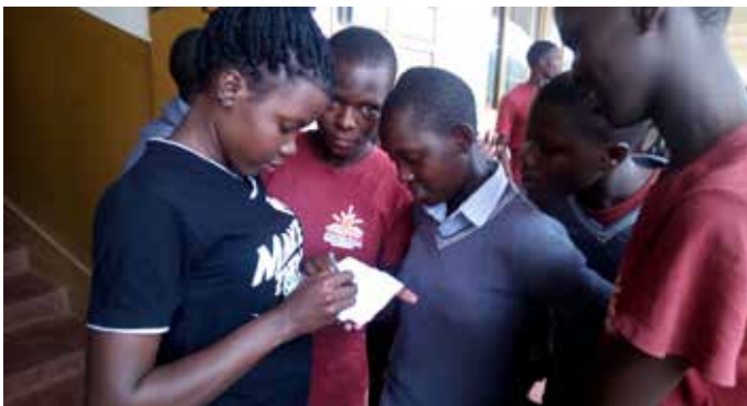
Rockies member sharing experience with Musana Students

Our team made a learning visit to Musana Community Development Organization a Segal partner in Iganga. The rationale for this tour was to share and compare notes on the models we each use to empower young people. Musana having a formal education approach, wanted to know how Rockies has managed to tailor skills development programs that suit the current learnt dynamic.