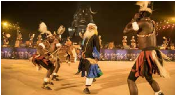
Rockies Troupe performing in India with Sadghuru at the Isha Foundation Cultural performance

Rockies Troupe equally had the opportunity to feature at the first ever Chinese Boat Festival. This is a very special cultural and historical celebration for the Chinese people; The Chinese Embassy in Uganda in partnership with The Ministry of Tourism organized this event as the first ever in Uganda. It took place at Uganda Wildlife Education Center where we took part as the main act performers.