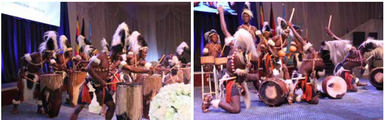
Performing for Agha Khan at Serena Hotel, Victoria Hall

Agha Khan Foundation during the time when they invited all their partners and the network agencies for a dinner at Kampala Serena Hotel, they equally invited Rockies Troupe to be the sole entertainers of the evening. The event was graced by Prince Karim Aga Khan IV and the Minister of Foreign Affairs Hon. Sam Kuteesa alongside other prominent dignitaries