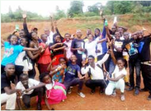
Rockies family at their newly acquired land in Nakawuka

Rockies Talent, Leadership and Skills Development Academy, a hub for all skills development initiatives that Rockies runs for the young people. The major highlight of this year, is that we have been able to acquire 2 acres of land in Nakawuka-Wakiso district where the academy will be established thanks to Segal Family Foundation, our board chairperson alongside her team, all our development partners and the good Samaritans. We have also been able to increase our intake by 8 talents making our current total of 50 young people 24 of these are girls and 26 boys.