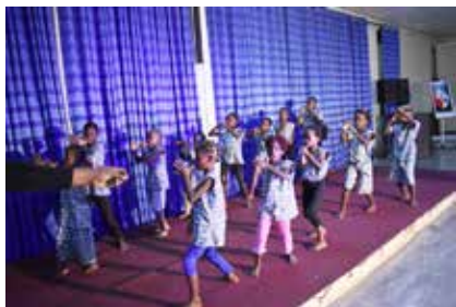
The Mulia Kids at their concert inspired by Rockies Troupe

With our continued networking, we joined Tweekembe Development Organization and Music for Life Africa Foundation (MULIA) Segal Family partners during their fundraising concert a gesture that has kept our working relationship healthy as we equally helped inspire the young children MULIA takes care of. This followed a learning visit made by Tweekembe administration to Rockies in a bid to learn our working model.