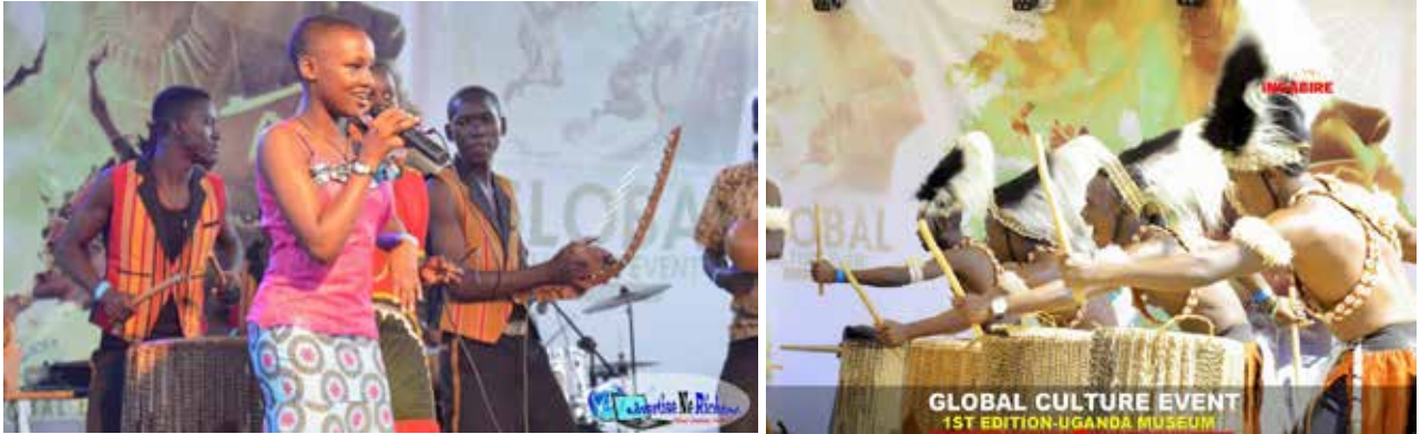
Rockies Troupe team performing at the Annual Global Cultural Event that took place at Uganda Museum organized by Mary Ingabire Global Events.

Rockies Troupe also took part at the Annual Global Cultural Event that took place at Uganda Museum organized by Mary Ingabire Global Events. This was the inaugural event that attracted over 30 cultures across the country showcasing their different life style that included dance, clothing and food among others. Rockies Troupe was invited as a special act to give a much more professional feel to our Uganda's performing and creative arts arena.