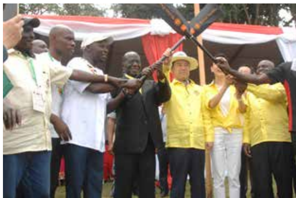
Vice president of Uganda, Chinese Ambassador to Uganda launching the Chinese Boat Festival

Rockies Troupe equally had the opportunity to feature at the first ever Chinese Boat Festival. This is a very special cultural and historical celebration for the Chinese people; The Chinese Embassy in Uganda in partnership with The Ministry of Tourism organized this event as the first ever in Uganda. It took place at Uganda Wildlife Education Center where we took part as the main act performers.